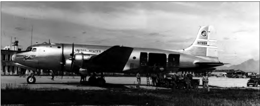
A C-54 unloads at Kimpo Airfield, September 1950.

The invasion of Inchon got underway on September 15. Taken by surprise, the enemy offered only light opposition. Three days later, advance elements of