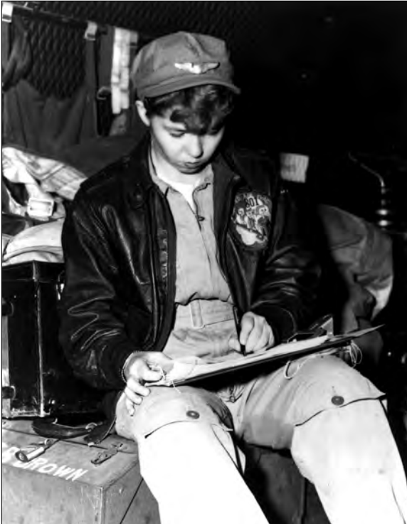
A flight nurse with the 801st Medical Air Evacuation Squadron, above , offers a cigarette to an evacuee of the Korean War during a C-124 flight in December 1952. Another nurse from the same unit completes paperwork, this during a C-54 flight in May 1952.