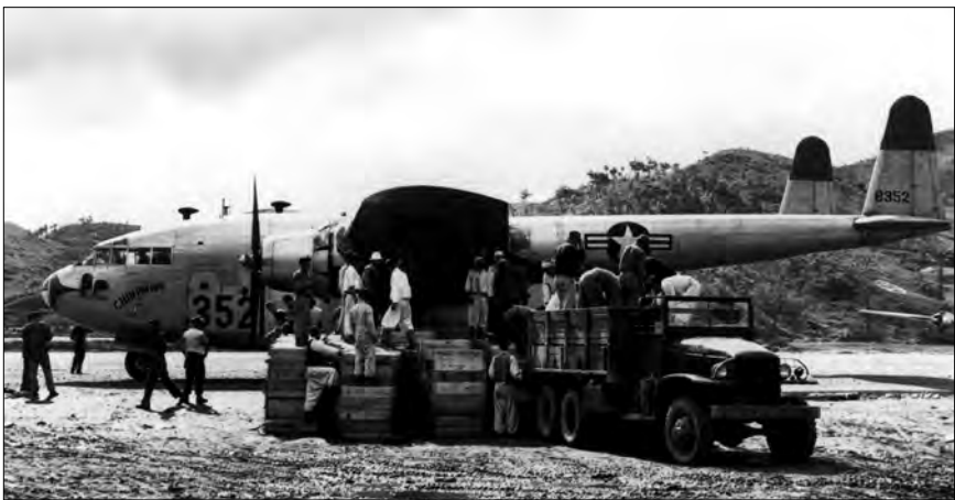
C-119 unloads at an airfield near the frontlines in Korea, June 1951.

Fortunately, a significant number of modified C-119s were available to permit a major airlift of ammunition to Korea beginning on May 20. The Chinese launched a vicious offensive in mid-May when some 175,000 men struck