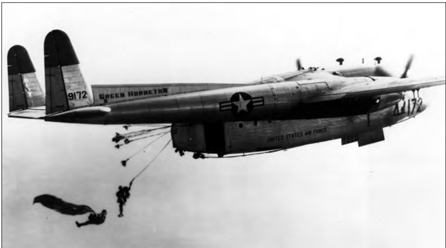
Paratroopers from the 187th Regimental Combat Team leave a C-119 during a practice jump in Japan.

On March 7, 1951, the Eighth Army again took the initiative, pushing north from Wonju. The offensive made rapid progress, and Seoul fell to the advancing U.N. forces on March 15. Planners in Tokyo had hoped to drop the 187th Regimental Combat Team in the Seoul area, but the speed of the U.N. advance caused the objective of the airdrop to shift to Chunchon. The new DZ had a number of advantages. Chunchon was an important rail terminus, just south of the 38th parallel in central Korea and a promising site for an airfield. The airborne troops would be dropped when the front line was 10 miles away and the two forces could be linked up within 24 hours. The operation, if successful, would trap a large number of enemy troops in flight northward.