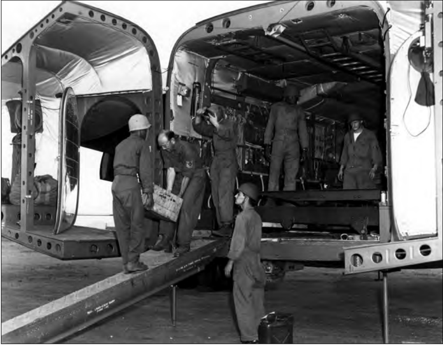
A C-119 unloads at Kimpo Airfield shortly after its capture, September 1950.

X Corps seized Kimpo Airfield, K-14, outside Seoul. At 1055 on September 19, Tunner notified his subordinates that aircraft could begin landing on Kimpo's long, hard-surfaced runway. The first C-54 arrived at 1426. It was followed by 8 additional C-54s and 23 C-119s. The transports brought in 208 tons of supplies and personnel, with most of the matériel destined for the Airlift Support Unit, which would handle the flood of aircraft and cargo in the days ahead.