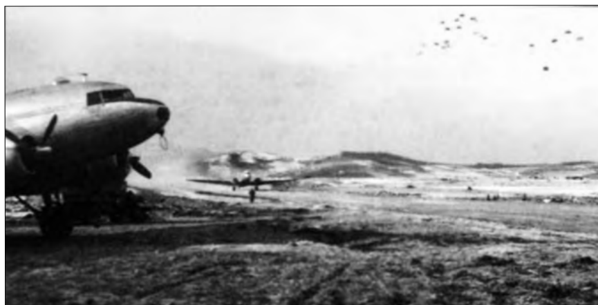
Operations at Hagaru-ri airstrip, December 1950. A C-47 at the left is being loaded with wounded as the C-47 in the background begins its takeoff. The C-119 overhead is dropping supplies.

The 5th and 7th Regiments of the 1st Marine Division reached Yudam-ni, about halfway up the west side of the Chosin Reservoir and 14 miles from Hagaru-ri, on November 25. Three infantry battalions and one artillery battalion of the 7th Infantry Division simultaneously advanced along the east side of the reservoir. Meanwhile, the 1st Marine Regiment protected the main supply route from Hagaru-ri to Koto-ri. Enemy opposition had been light throughout the advance.