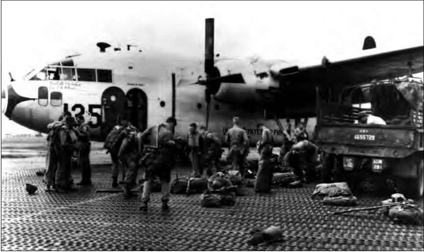
Paratroopers from the 187th Regimental Combat Team prepare to board a C-119 for a flight from Japan to Korea.

sion and the Eighth Army linked up near Osan, 20 miles south of Seoul. The South Korean capital fell to the 1st Marine Division the next day. In early October, MacArthur followed the directives of the Joint Chiefs of Staff and President Truman and ordered the Eighth Army to pursue retreating NKPA forces across the 38th parallel. At the same time, he shifted X Corps to the east coast of Korea, where it seized the port of Wonsan and began a drive toward the Yalu River.