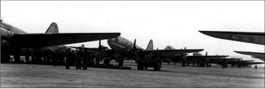
Paratroopers prepare to board C-46s for airdrop at Munsan, March 23, 1951.

On March 18, Eighth Army advised FEAF that D day would be March 22. Twenty-four hours before the planned drop, however, Chunchon fell to the swiftly moving U.N. forces. Eighth Army then switched the target to Munsan, 20 miles northwest of Seoul on the Imjin River, with the drop to take place on the morning of March 23.