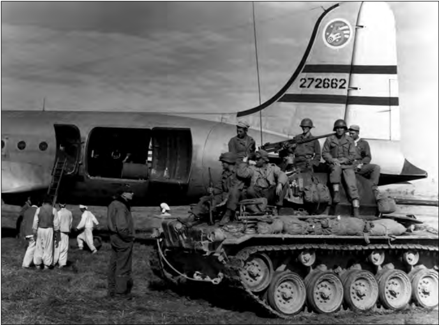
A C-54 unloads drums of gasoline at Sinmak for Eighth Army's northern advance, October 1950.

center of the resupply effort, Tunner jumped at the opportunity to use airfields closer to the advancing front. On October 26, Eighth Army captured an abandoned communist airstrip at Sinanju on the south side of the Chongchon River. Army engineers quickly patched and rolled hard the sand and gravel runway, extending it to 5,500 feet. Combat Cargo aircraft began using K-29 on October 30, often landing in the midst of enemy sniper and artillery fire. By November 17, Tunner's airmen had delivered 4,041 tons of urgently needed supplies to advance elements of Eighth Army.