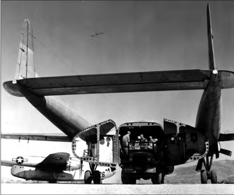
A C-119 is unloading a jeep at an advanced air base in Korea.

gistical situation, and the efficiency with which the officers and airmen of Combat Cargo Command carried out the highly important operation again demonstrates the close cooperation that exists between ground and air in the Korean War.”