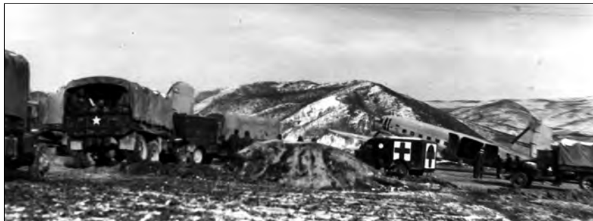
Casualties being loaded aboard Combat Cargo C-47s at Hagaru-ri, December 1950. The hills in the background are controlled by Chinese troops.

from the Royal Hellenic Air Force flew 8. The 62 sorties brought in 254,851 pounds of freight and 81 replacement marines. They took out 1,561 casualties and 12,200 pounds of cargo. Unfortunately, there was neither the time nor the space on the airplanes to bring out all the bodies of the dead.