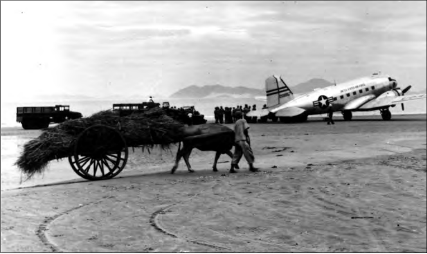
C-47 on the beach at Chodo during Operation Beachcomber, September 1952