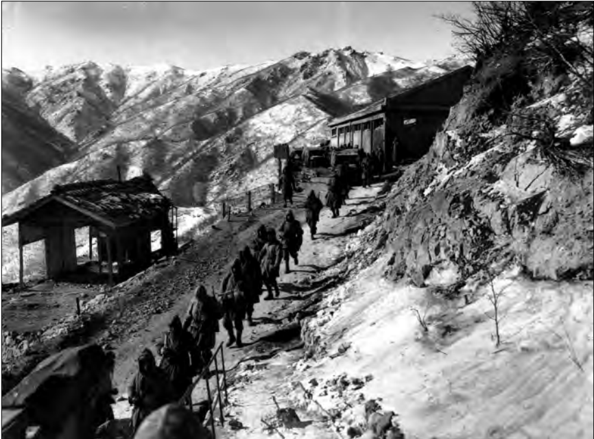
Marines gaze at the gap in the bridge over the Funchilin Pass that must be spanned to permit them to bring out their equipment. The next day, December 10, 1950, the men are crossing on the treadway bridge that was airdropped to them and that they have installed overnight.