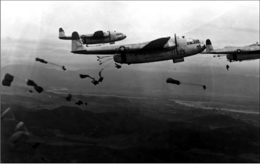
Airdrops over Sunchon, October 20, 1950

October 10, plans were finalized for a drop in the Sunchon-Sukchon area, 35 miles north of Pyongyang. The aim of the operation was to seize critical road junctions and cut off retreating enemy forces. Planners also hoped that U.S. prisoners of war (POWs) might be liberated from the trapped North Koreans.