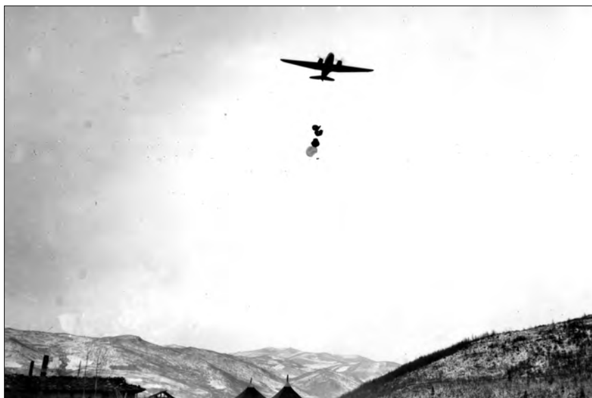
A C-47 making an airdrop at Yudam-ni, November 29, 1950.

Maj. Gen. Oliver P. Smith, commander of the 1st Marine Division, recognized that it was essential to hold Hagaru-ri if his men were to escape the Chinese trap. On November 28, he had ordered a relief convoy sent from Koto-ri to Hagaru-ri. Task Force Drysdale, however, was ambushed by Chinese troops on November 29. It lost 162 men killed or missing and 159 wounded, plus 75 vehicles. Nonetheless, a portion of the force—some 400 U.S. marines and Royal Marine Commandos—managed to escape. "The casualties of Task Force Drysdale were heavy," Smith acknowledged, "but by its partial success