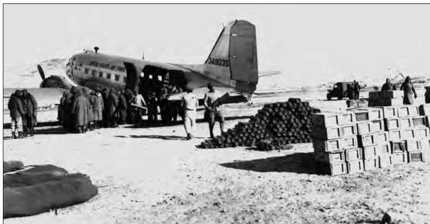
Artillery ammunition is being off-loaded from a Combat Cargo C-47 at Hagaru-ri as a group of walking wounded wait to board. December 5, 1950.

Ten thousand pictures could not convey the composite sensations to the viewer; significantly the smell—a horrible, pungent combination of blood on filthy combat fatigues, unwashed bodies, spent gunpower, and vehicle exhaust fumes—all accented in the nostrils by subfreezing temperatures. Nor could pictures convey the miserable bone-chilling cold (stunning to this ex-Minnesotan) at this altitude in the high country of northeast Korea.