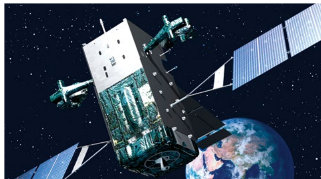
Illustration: Lockheed Martin

Contractor: Boeing (II, IIA, IIF), Lockheed Martin (IIR, IIR-M, IIIA). Operator/Location: AFSPC; Schriever AFB, Colo. First Launch: Feb. 22, 1978. IOC: Dec. 9, 1993. Design Life: 7.5 yr (II/IIA); 7.5 yr (IIR/IIR-M); 12 yr (IIF); 15 yr (IIIA). Launch Vehicle: Delta II, Delta IV, Falcon 9 (planned). Constellation: 31 spacecraft (not including decommissioned or on-orbit spares). Active Satellites: • GPS Block IIA. Launched 1990 to 1997. One reactivated in 2018. • GPS Block IIR. Launched 1997 to 2004; 11 active. • GPS Block IIR-M. Launched in 2005 to 2009; seven active. • GPS Block IIF. Launched in 2010 to 2016; 12 active. • GPS Block IIIA/IIIF. New generation launched in 2018; one in on-orbit checkout. Dimensions: (IIR/IIR-M) 5 x 6.3 x 6.25 ft, span incl solar panels 38 ft; (IIF) 9.6 x 6.5 x 12.9 ft, span incl solar panels 43.1 ft. Weight: On orbit, 2,370 lb (IIR/IIR-M); 3,439 lb (IIF). Performance: Orbits the Earth every 12 hr, emitting continuous signals, providing time to within one-millionth of a second, velocity within a fraction of a mile per hour, and location to within a few feet. Orbit Altitude: 10,988 miles. Power: Solar panels generating 700 watts (II/IIA); 1,136 watts (IIR/IIR-M); up to 2,900 watts (IIF).