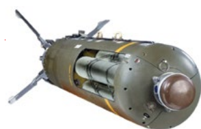
Illustration: Textron Systems

Integration: AC-130W (A); MQ-9 (B); planned: AC-130J (A).